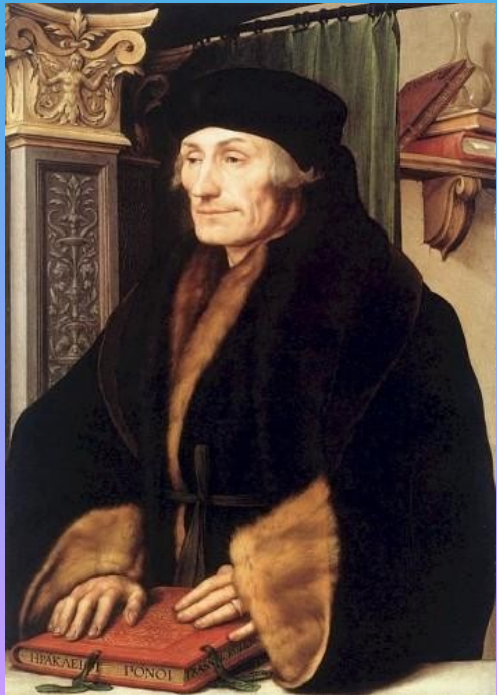
Erasmus of Rotterdam by Hans Holbein (1523)