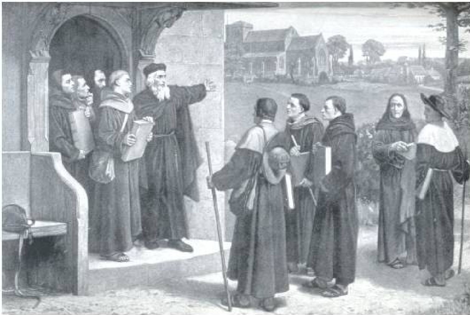
Wyclif Giving "The Poor Priests" His Translation of the Bible

c. 1380 enlisted 'poor priests' known as 'Lollards' from Oxford graduates.