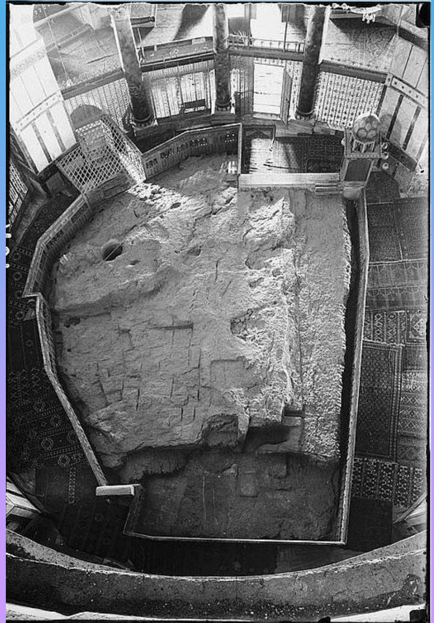
Foundation Stone – Dome of the Rock