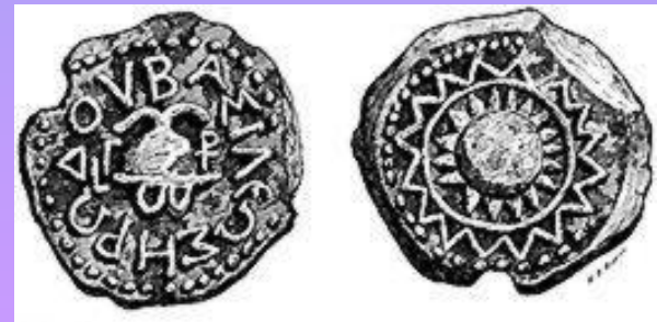
Coins from time of Herod the Great