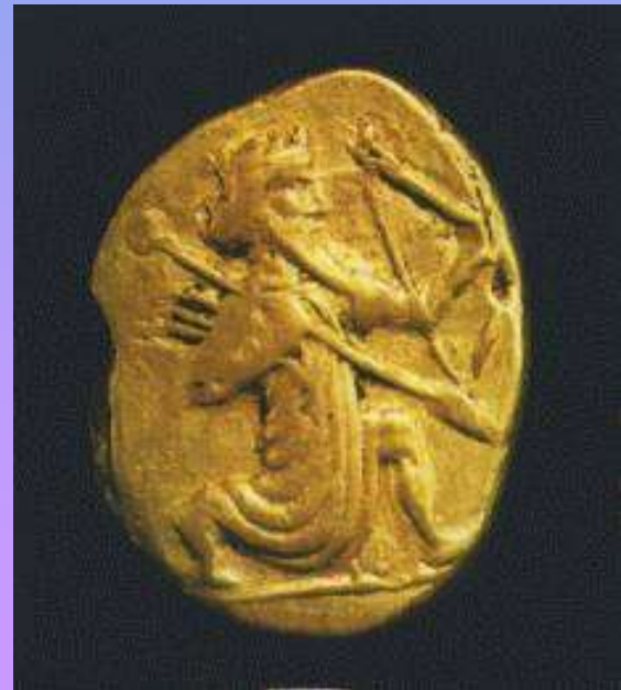
Coin of Xerxes (Ahasuerus)